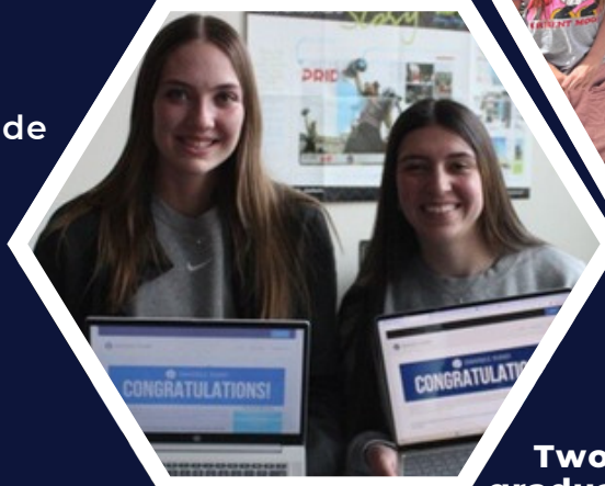
Two of our 2025 graduates are Daniel Scholars Recipients