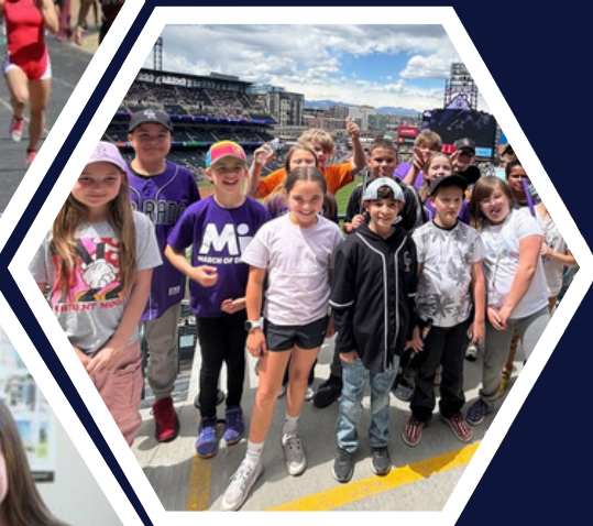
Rockies Stem Day Field Trip