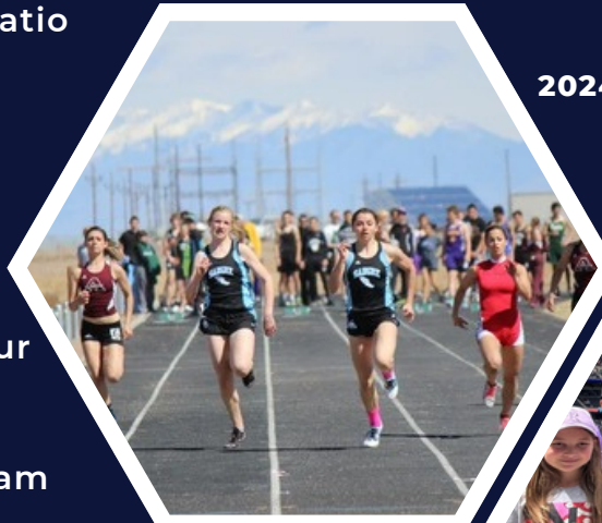
2024-2025 State Qualifiers -Pole Vault -Hurdles -400m -800m